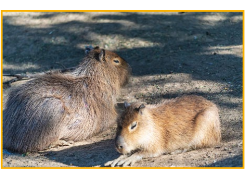
Now, you can have some fun! See if you can come up with your own headline for a fake news story.