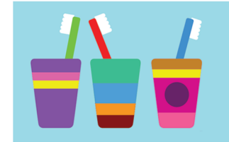
Rinse brush and put back