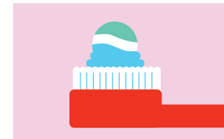
Squeeze on toothpaste