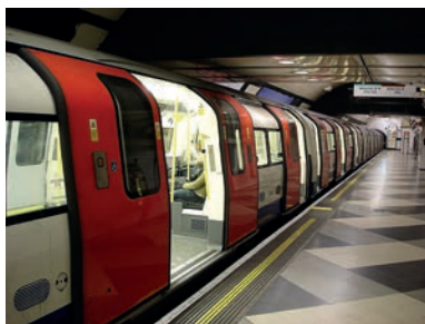
Modern underground train