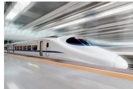
The 'Bullet' train, Japan