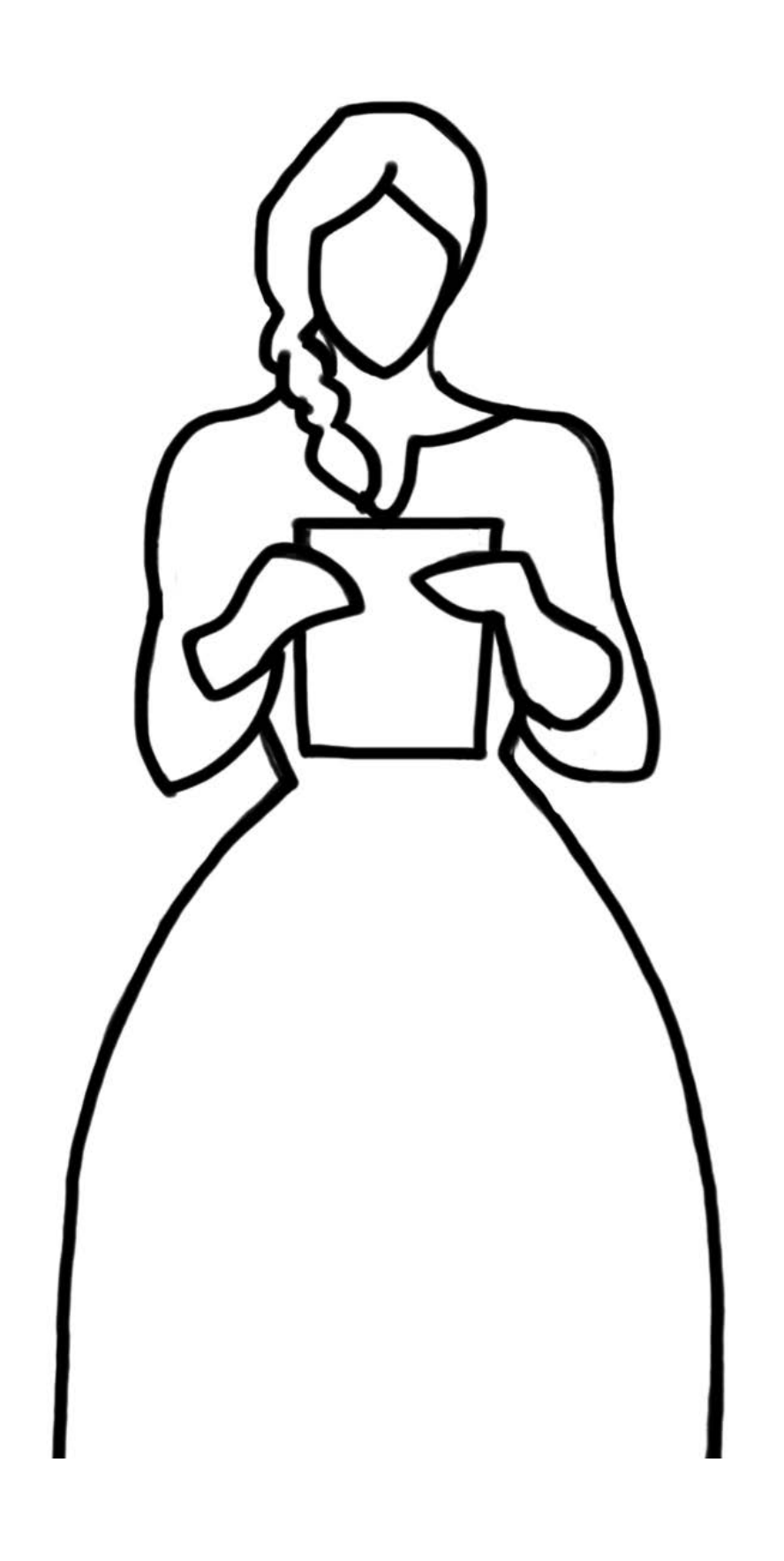
RESOURCE SHEET 2: LADY MACBETH ROLE ON THE WALL CHARACTER SHEET