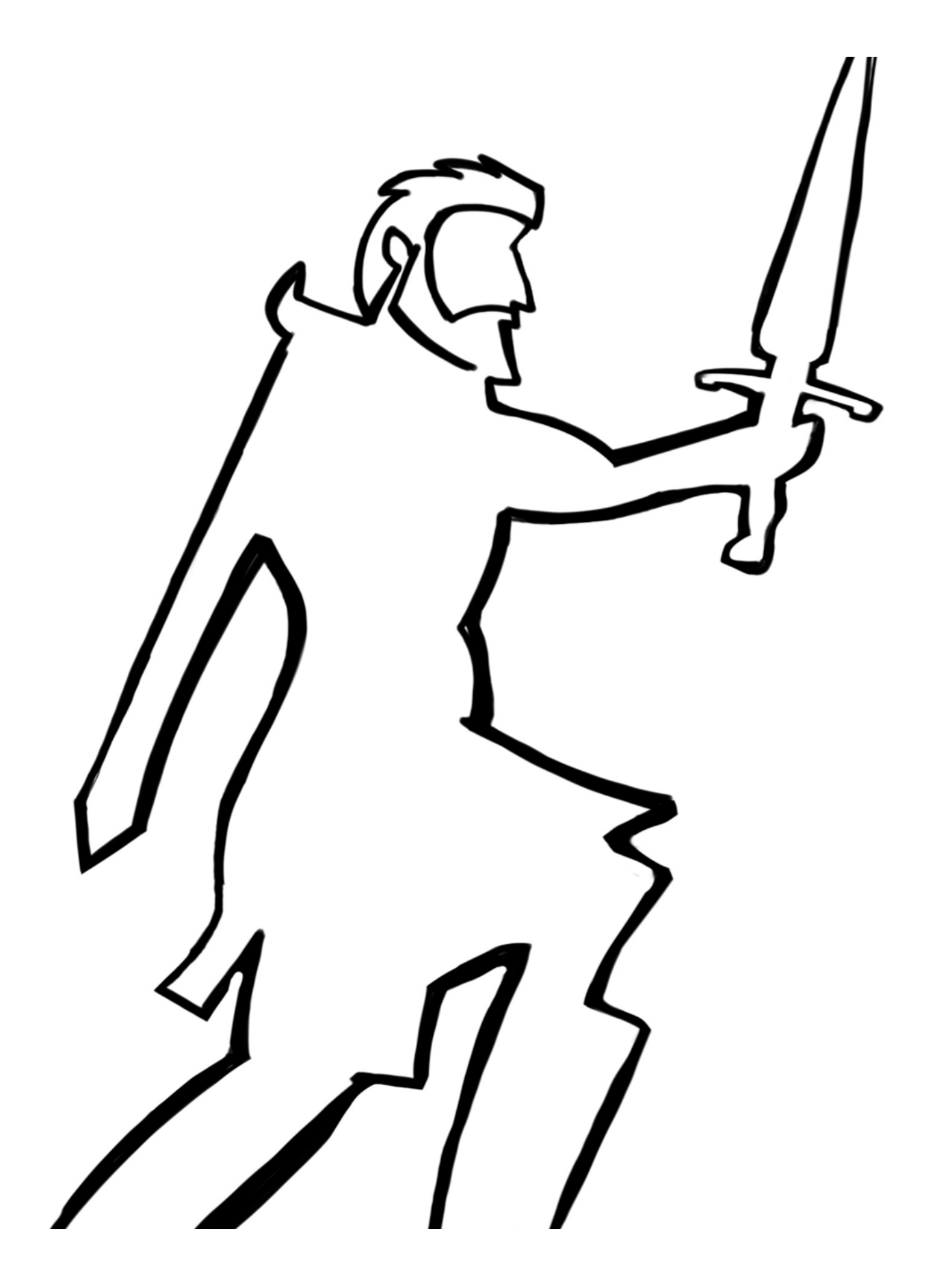
RESOURCE SHEET 1: MACBETH ROLE ON THE WALL CHARACTER SHEET