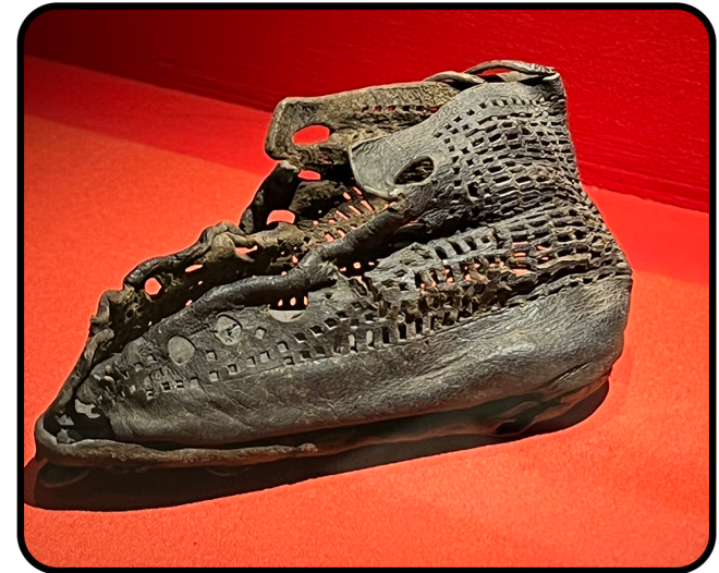
shoe 3 Length 113 mm

Which shoe do you think cost the most? _____