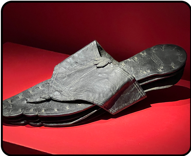
shoe 1 Length 215 mm

Activity 2: Look at these shoes found at Vindolanda. Which shoe do you think was the most expensive and why? Who do you think it belonged to?