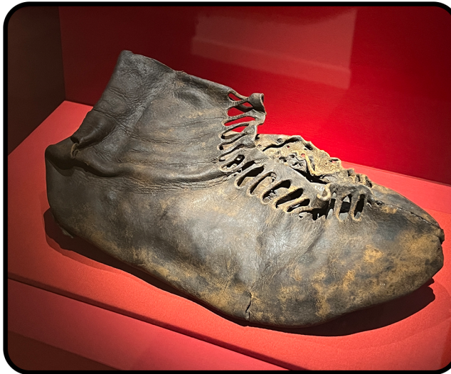
shoe 2 Length 265 mm