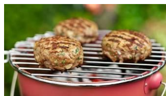
9. barbecue Arawak