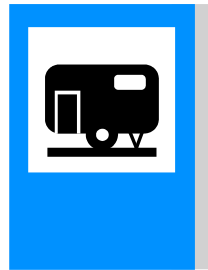
2. caravan Farsi