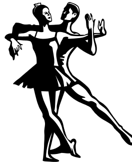
6. ballet French