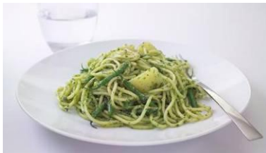
5. spaghetti (or pasta) Italian