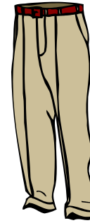
4. Trousers Gaelic