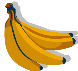
10. bananas Wolof

These words entered the English language through colonialism, trade, art, music and travel.