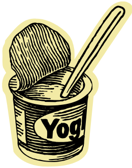
1. yoghurt Turkish