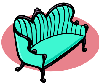
8. sofa Farsi