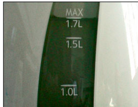
This scale is in litres .