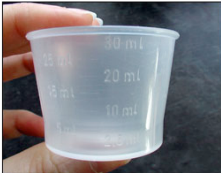
This scale is in millilitres .

First, look to see what the unit of measurement is. Is the scale in millilitres (ml) , centilitres (cl) or litres (l) ?