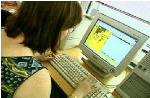
The internet is a rich source of information

Choose four search terms from this table.