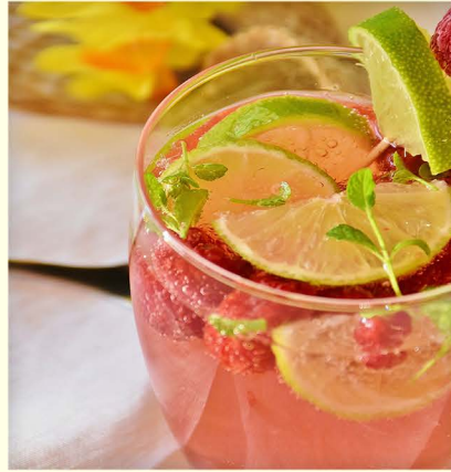
Las aguas frescas

A drink made of a combination of fruits, grains, flowers or seeds, blended with sugar and water.