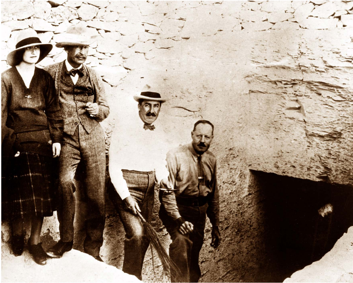
Howard Carter (second from right) and Lord Carnarvon (second from left) at the entrance to the tomb.