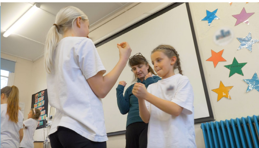
Pupils working collaboratively in a pair.

Consider 'role reversal' - if your support works with a particular child, can the staff member be in the dance with the pupil directing and coaching?