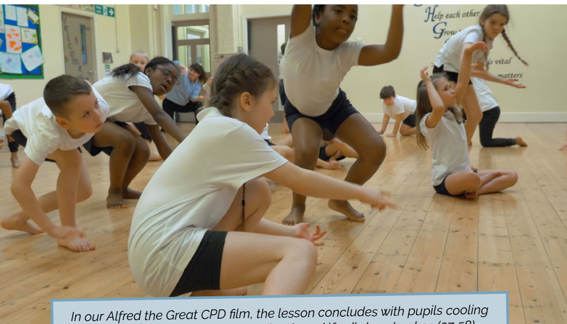
In our Alfred the Great CPD film, the lesson concludes with pupils cooling down by exploring the smoke rising from Alfred's burnt cakes (07 58).

This is important for their psychological as well as physical preparation. Warm up and cool down can be fully embedded into pupils learning and should flow seamlessly as part of the lesson, as demonstrated in the Step~By~Step Frameworks and Films.