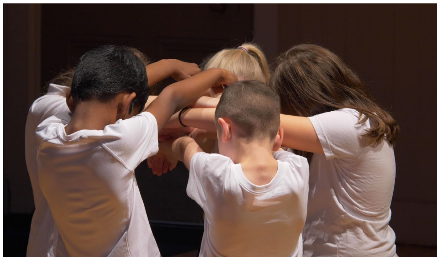
Pupils working together to create their strong 'burh' shapes.

You may want to focus in on a specific performance element to explore with your pupils (look back at the list on page 11). The films demonstrate effective use of a range of performance skills.