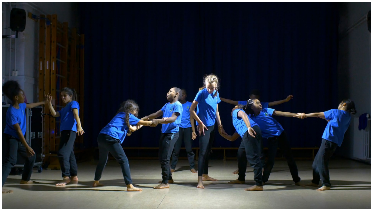
Y6 pupils perform their final Blitz dance.